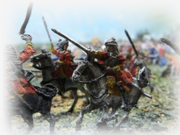
From the Battle of Sedgemoor Diorama