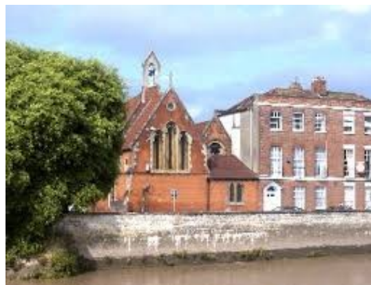
Saint Joseph's Church

A new Catholic chapel, dedicated to Saint Joseph was built in Binford Place in 1882, and extended in 1982.