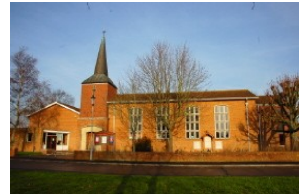
St Francis of Assisi, Saxon Green

After World War 2, more housing was built eastwards beyond the railway, to cater for increased population and a district church, Saint Francis of Assisi, was built at Saxon Green in 1960. It became a parish in its own right in 1965.