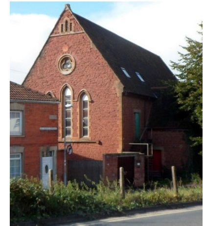
All Saints, Westonzoyland Road

In 1882 St John's opened a mission church, All Saints, off Westonzoyland Road, now used as a youth club.