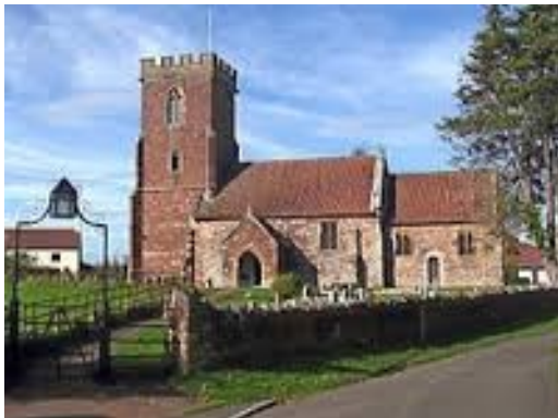
Chilton Trinity church.

Chilton Trinity church dates from the eleventh century, and has a Norman doorway. From 1749 it has been united with Saint Mary's, Bridgwater.