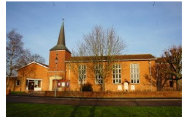
St Francis of Assisi, Saxon Green

After World War 2, more housing was built eastwards beyond the railway, to cater for increased population and a district church, Saint Francis of Assisi, was built at Saxon Green in 1960. It became a parish in its own right in 1965.