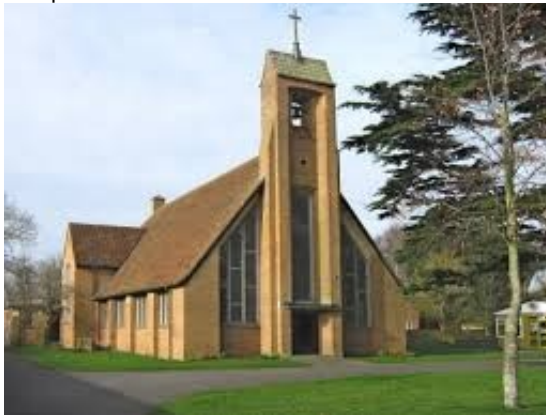
.Holy Trinity, Hamp.

demolished in 1964, but the churchyard retained as an open space.