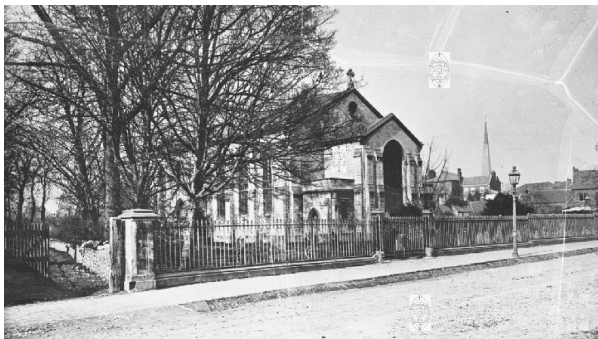
Holy Trinity, St Mary Street

From the start of the C19, Bridgewater's population grew from 3634 in 1801 to 7807 in 1831 causing a strain on the accommodation at St Mary's. A new church, Holy Trinity was built in 1840, becoming a District Chapel the following year.