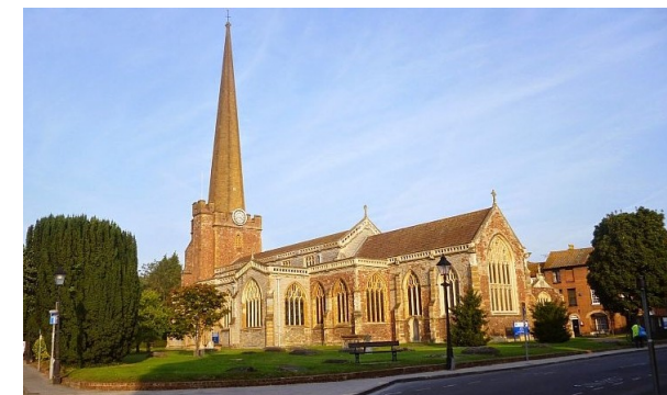
Saint Mary's, Bridgwater

The parish system was not established until the thirteenth century, when the areas and limits of the churches of the Lords of the Manor were transferred to ecclesiastical authority.