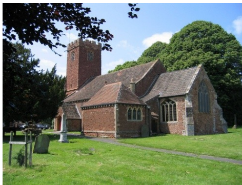
Saint George's, Wembdon

Saint George's Wembdon dates from the twelfth century. The parish includes a number of the suburbs of Bridgwater to the north west of the town.