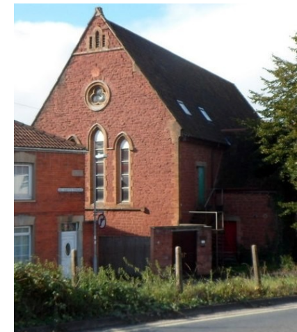
All Saints, Westonzoyland Road

In 1882 St John's opened a mission church, All Saints, off Westonzoyland Road, now used as a youth club.